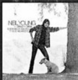
EVERYBODY KNOWS THIS IS NOWHERE