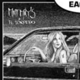
MATT MAYS & EL TORPEDO