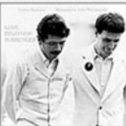
LOVE DEVOTION SURRENDER