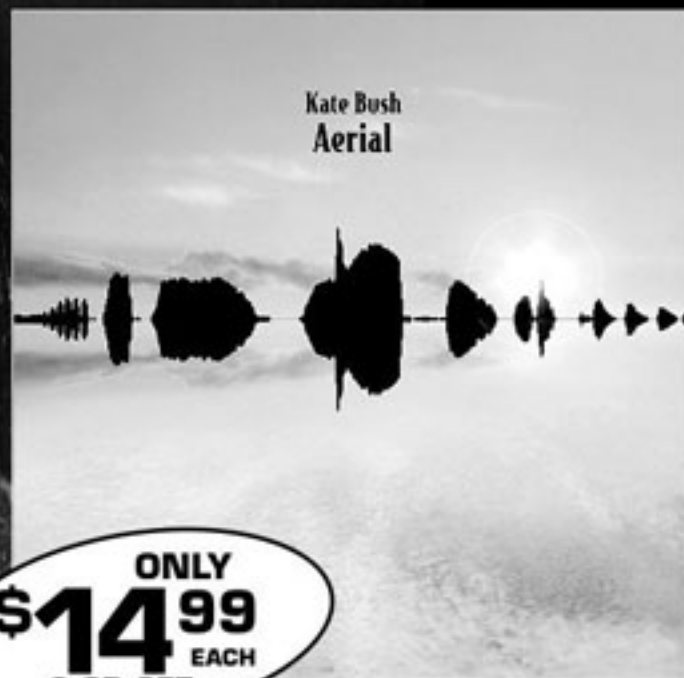
Kate Bush Aerial

NEW RELEASE TUESDAYS AVAILABLE TUESDAY NOVEMBER 8