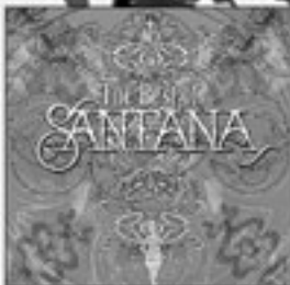
THE BEST OF SANTANA