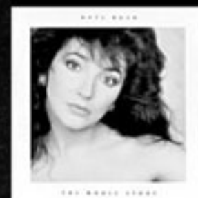
THE WHOLE STORY