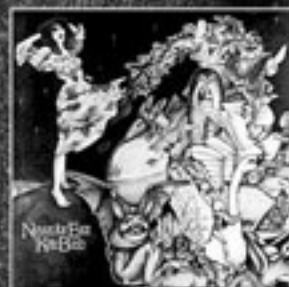
NEVER FOR EVER