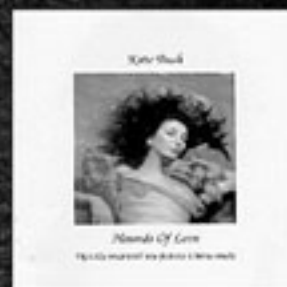
HOUNDS OF LOVE