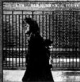
AFTER THE GOLD RUSH