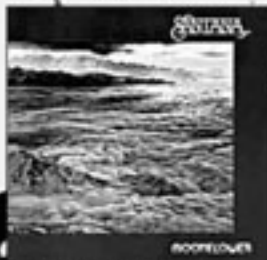
MOONFLOWER (2CD SET)