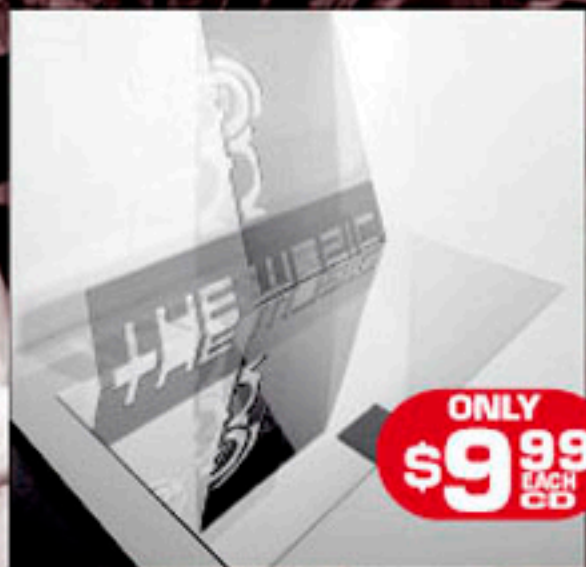
Welcome To The North