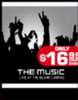
Live At The Blank Canvas (DVD)