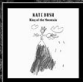
KING OF THE MOUNTAIN (single)